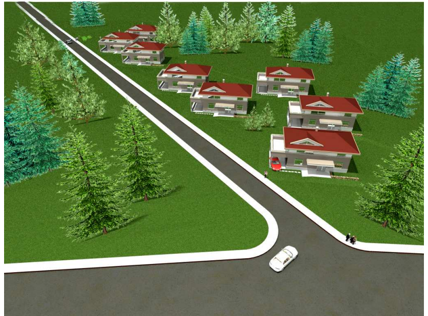
Concept picture to show property layout only adjoining property not shown

Constructed to high standards and offered as complete with Bathrooms